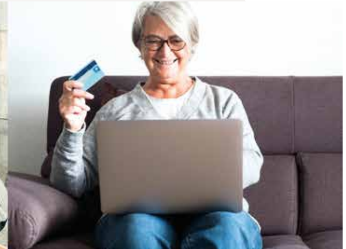
High Street Savings