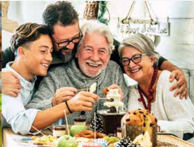
Up to 20% Discounts on Eating Out