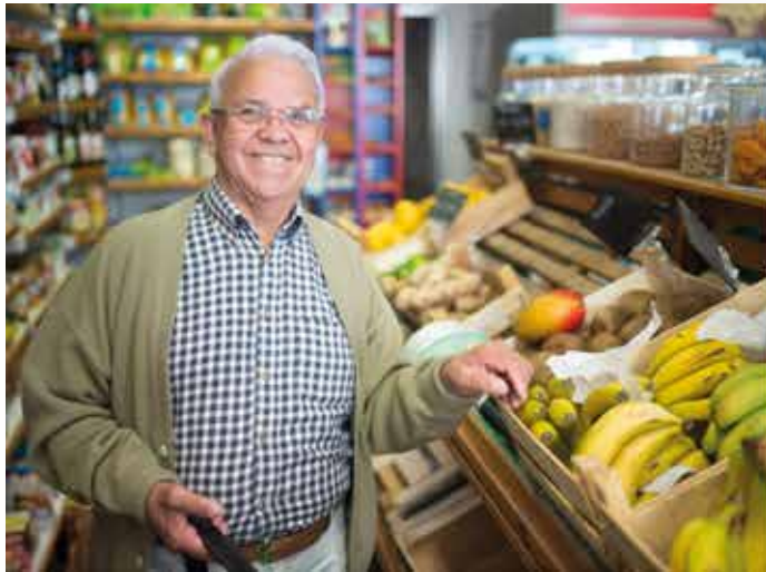
Saving £s on weekly shopping